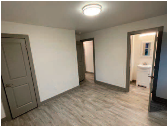
Master Bedroom w/bath