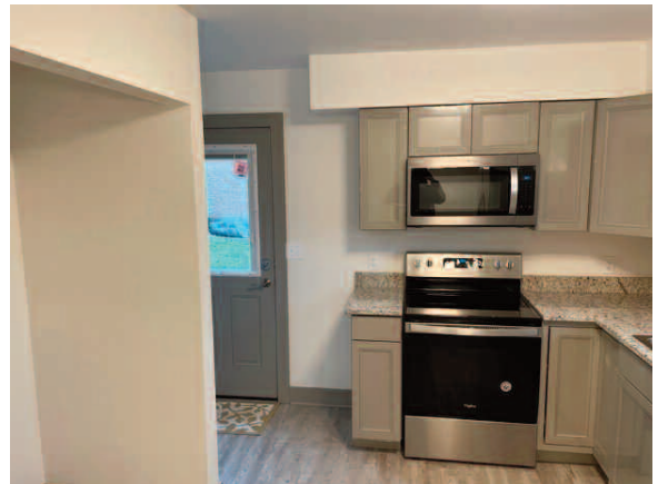
Kitchen and back door