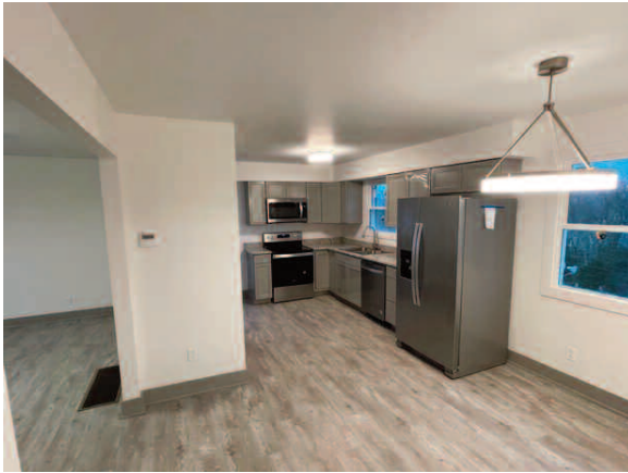
View from hallway