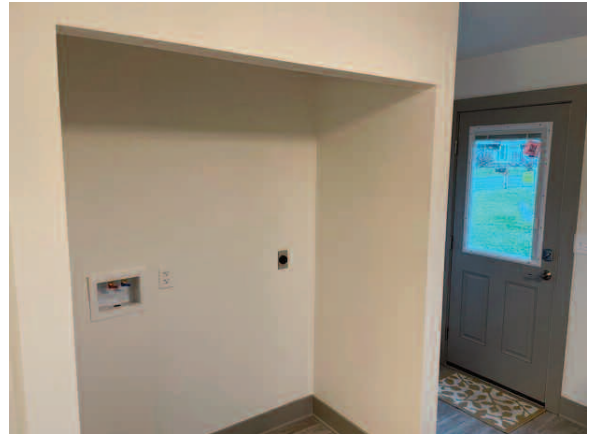
Laundry area and back door