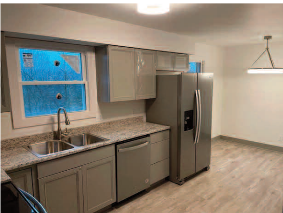
Kitchen & Dining Area