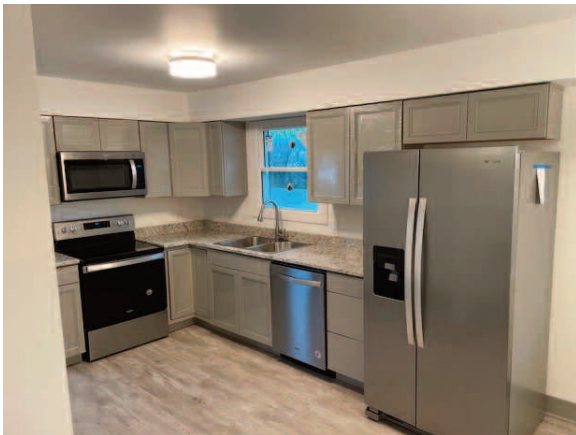
New Whirlpool SS appliances