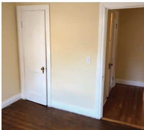
Downstairs Bedroom #1