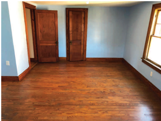
Upstairs bedroom #3 w/large closet