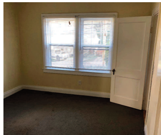
Downstairs Bedroom #2

For additional information, contact: Alan Newkirk - 859-585-1963 - Alan@NewkirkVentures.com