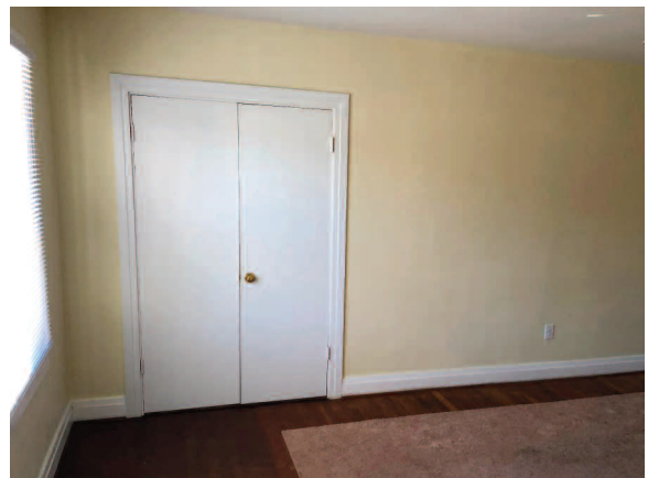
Living Room w/door into bonus room