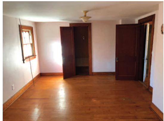
Upstairs Bedroom #4 w/large closet