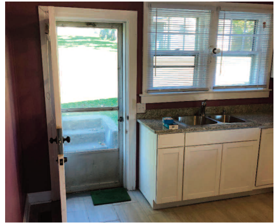
Back door opens into large yard