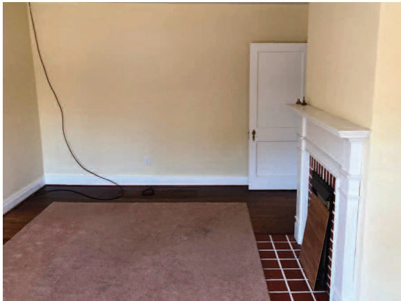
Living Room w/ fireplace