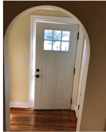
Front door and Entryway