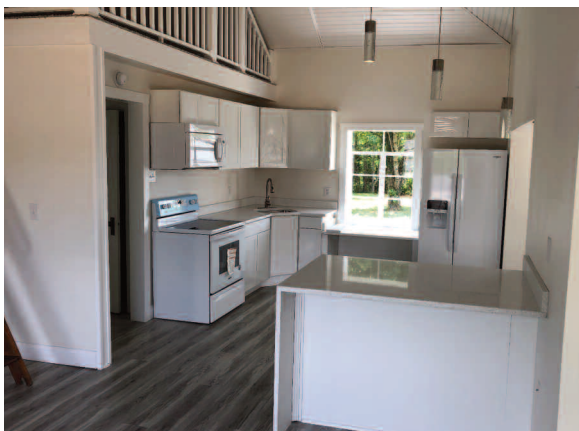
Quartz Waterfall Counter