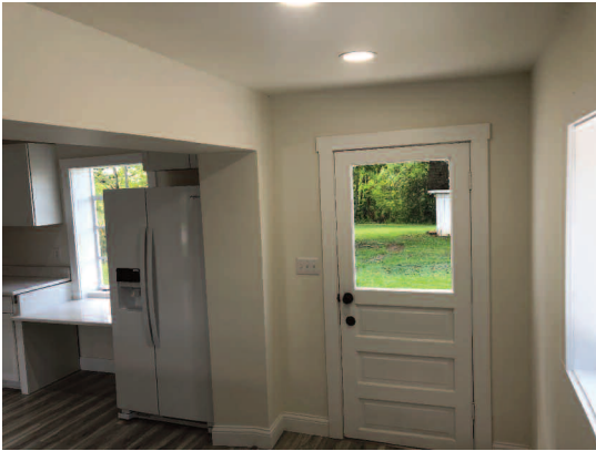
Back door & Mud room