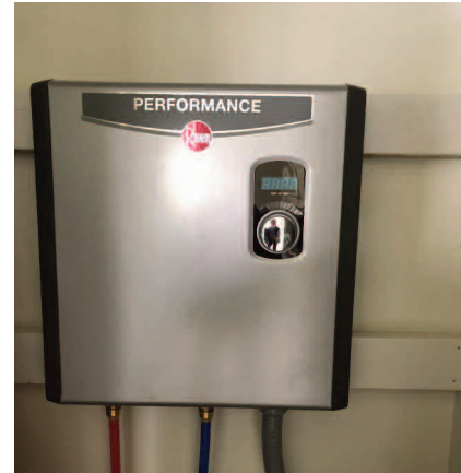
High output tankless water heater