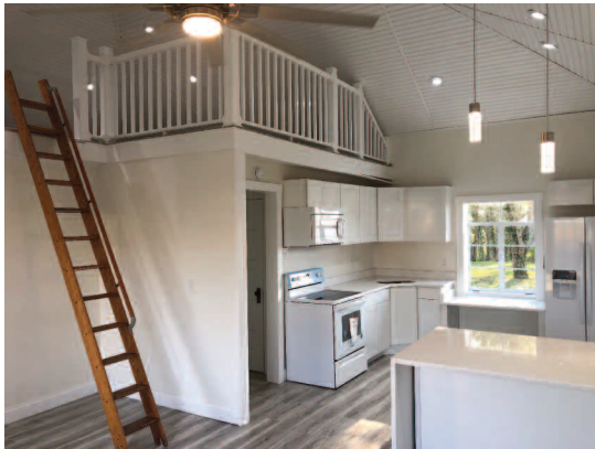
Sleeping loft access