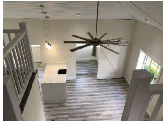
Great room from Sleeping loft