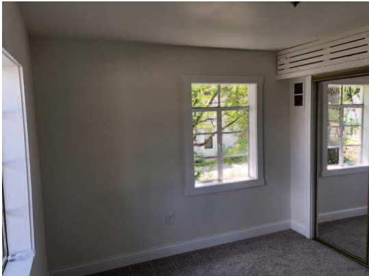
Bedroom #1 w/sliding closet doors