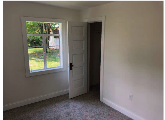
Bedroom #2 w/large closet