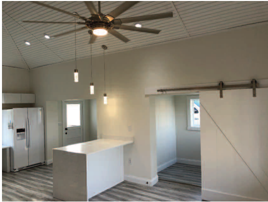
Interior View from front door