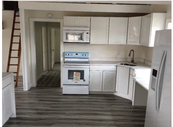
Interior View from back door